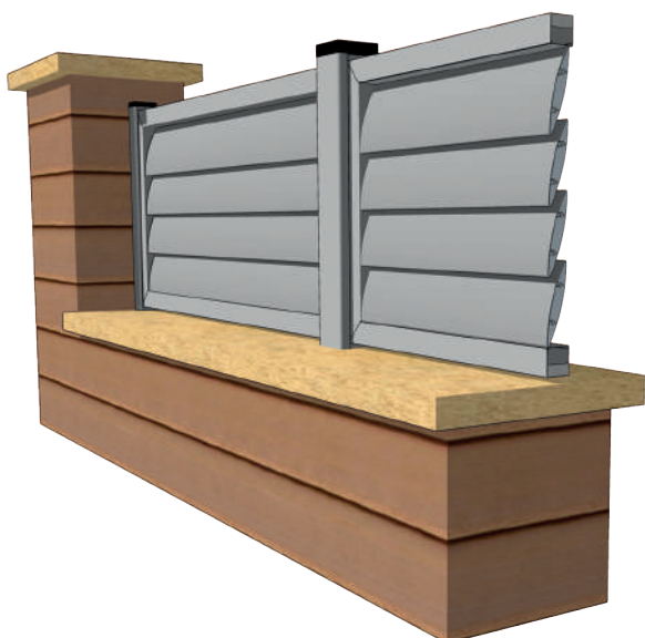
Lama ovalada 120, vertical u horizontal.