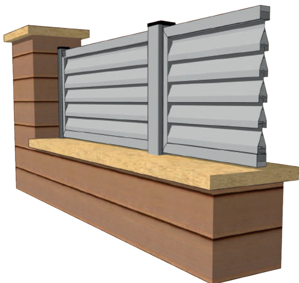
Lama Y-90 tubular, vertical u horizontal.