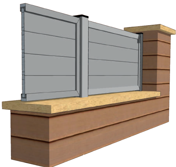
Lama ciega machihembrada 120x22 en vertical, horizontal o inclinada.