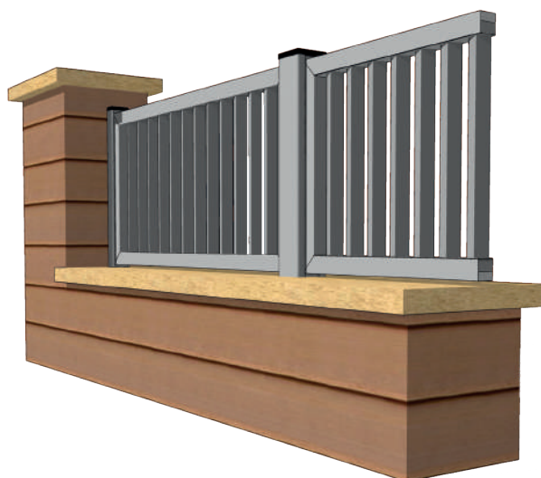
Barrote cuadrado 30x30, vertical u horizontal, recto o inclinado 25°.